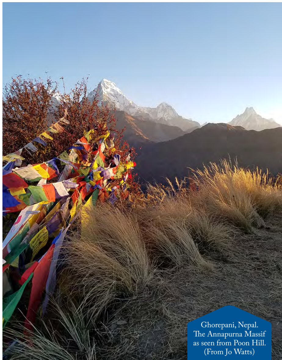
Ghorepani, Nepal. The Annapurna Massif as seen from Poon Hill.