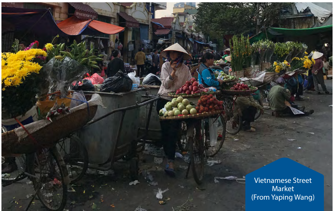
Vietnamese Street Market (From Yaping Wang)

with excitement and frustration. She saw titles of valuable materials in catalogs in both Archives but was only allowed to view a very small portion of them due to political sensitivity. However, Wang was able to gain access to essential materials through creative means. For example, through contacts at the VASS, she obtained copies of an internal publication, a collection of media reports on Sino-Vietnamese affairs during the 1980s and 1990s. In the end, she found most of the materials she needed. In addition, while waiting for approval of her requests to access the archives, she found time to make an excursion to the Sino-Vietnamese border area, mingle with the local ethnic minorities, and visit sites where the war was fought. This, she says, was perhaps the most memorable part of the entire trip.