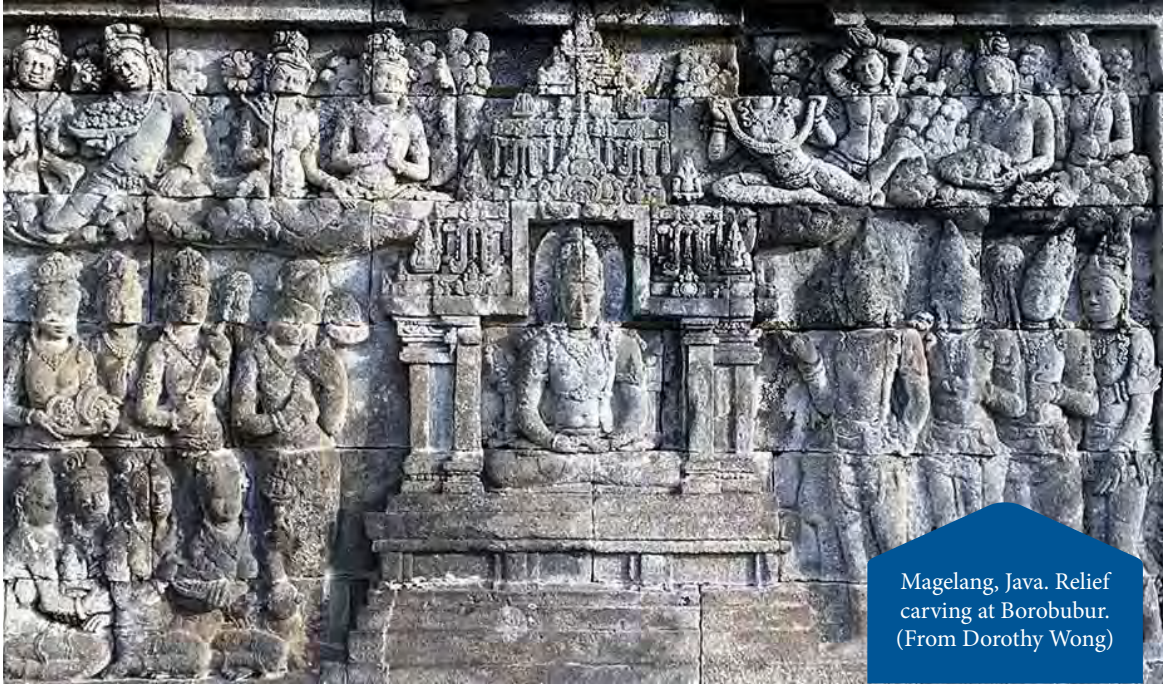
Magelang, Java. Relief carving at Borobudur.