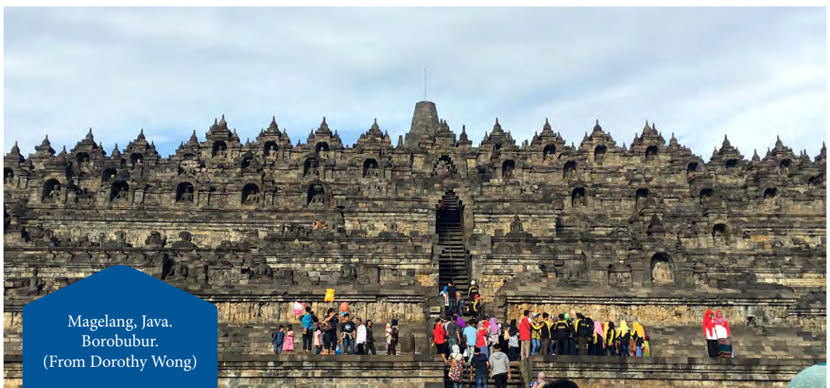
Magelang, Java. Borobudur.